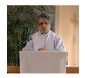
News You Can Use