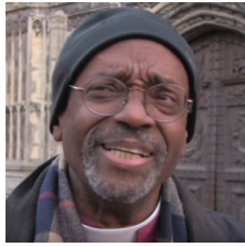
Presiding Bishop Michael Curry's response

Communiqué from the Primates of the Anglican Communion ← Click here to read