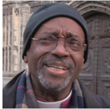
Presiding Bishop Michael Curry's response

Communiqué from the Primates of the Anglican Communion ← Click here to read