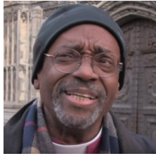
Presiding Bishop Michael Curry's response

Communiqué from the Primates of the Anglican Communion ← Click here to read