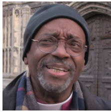
Presiding Bishop Michael Curry's response

Communiqué from the Primates of the Anglican Communion ← Click here to read