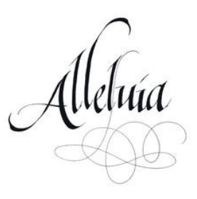
One service - 7 PM

Farewell, Alleluia: On the last Sunday of the Epiphany Season (February 26th) before Lent begins, the "Alleluia, the Hebrew exclamation of praise and glory to God," is "put away" during the penitential Season of Lent and is not sung again until Holy Saturday Night, the Great Vigil of Easter. This ancient tradition goes back centuries to the middle ages. A piece of parchment in a parish church or monastery would have been lettered by hand with the word Alleluia. The "Alleluia" sign was rolled up, and placed in a box and 'hidden' for the Season of Lent. Sometimes the parchment was burned outside with a procession of clergy, acolytes and people, and the ashes sprinkled into the ground to symbolize a 'burial' of the "Alleluia." Then, at Easter, the Alleluia parchment was taken out with much singing as the Alleluia once again, in affirmation of the death and resurrection of Christ, was "restored" to the Eucharist. We will 'bury' the Alleluia on the Last Sunday of the Epiphany at the end of the Service after the final hymn.