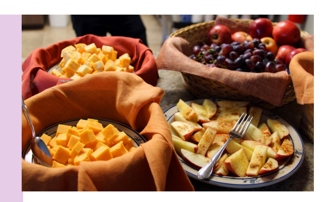
Foods in Scripture