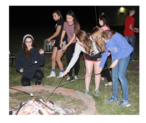
Fun and Fellowship