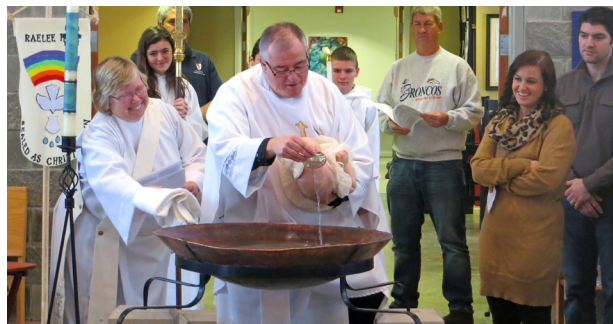
Just as God's promises are front-and-center in our lives, our baptismal font is front-and-center in our sanctuary.