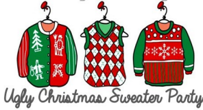
Ugly Christmas Sweater Party

Holy Family Christmas Party: ‘Tis the Season to Rock Ugly Sweaters! Pull out that tacky Christmas sweater, fashion a Goodwill-inspired pullover, find those jingle bell elf shoes...it’s time for the 8th Annual Holy Family Christmas Party! If you’d like, join in on the casual fun and wear your favorite “ugly Christmas sweater.” The evening will be held in the Parish Hall on Saturday, December 2nd, from 7:00-10:00 PM. Please RSVP to attend the party here . *While we love your children, this is an adult-only event. Also, we'd love some help providing some of the food & beverages, so please sign-up at this link so that we know what you are bringing. Please drop off items in disposable or well-labeled containers at the church on Sunday, November 26th or Saturday, December 2nd between 9 AM and 12 Noon or 5-6 PM. We will also need some help cleaning up after the party on December 2nd to be ready for church on Sunday. Please sign up and join us!