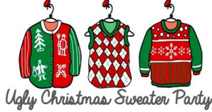
Ugly Christmas Sweater Party

Holy Family Christmas Party: ‘Tis the Season to Rock Ugly Sweaters! Pull out that tacky Christmas sweater, fashion a Goodwill-inspired pullover, find those jingle bell elf shoes...it’s time for the 8th Annual Holy Family Christmas Party! The evening will be held in the Parish Hall THIS Saturday, December 2nd, from 7:00-10:00 PM. Please RSVP by Friday, December 1st to attend the party here . *While we love your children, this is an adult-only event. Also, we’d love some help providing some of the food & beverages, so please sign-up at this link so that we know what you are bringing. Please drop off items in disposable or well-labeled containers at the church on Sunday, November 26th or Saturday, December 2nd between 9 AM and 12 Noon or 5-6 PM. We will also need some help cleaning up after the party on December 2nd to be ready for church on Sunday. Please sign up and join us!